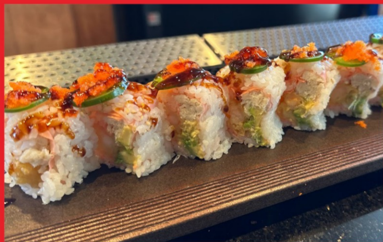
Tokyo Roll $ 17.95 Spicy tuna, dynamite mix, shrimp tempura, avocado tobiko wrapped with soy paper