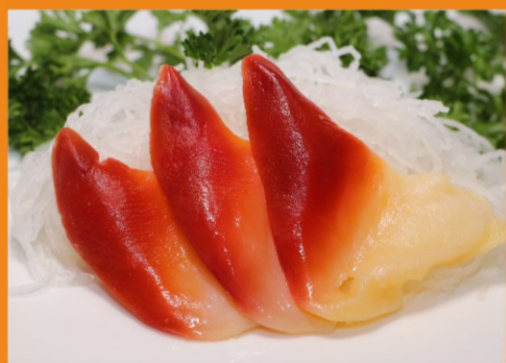
Surf Clam Sushi 1pc $ 2.50 Sashimi 3pc $ 7.50