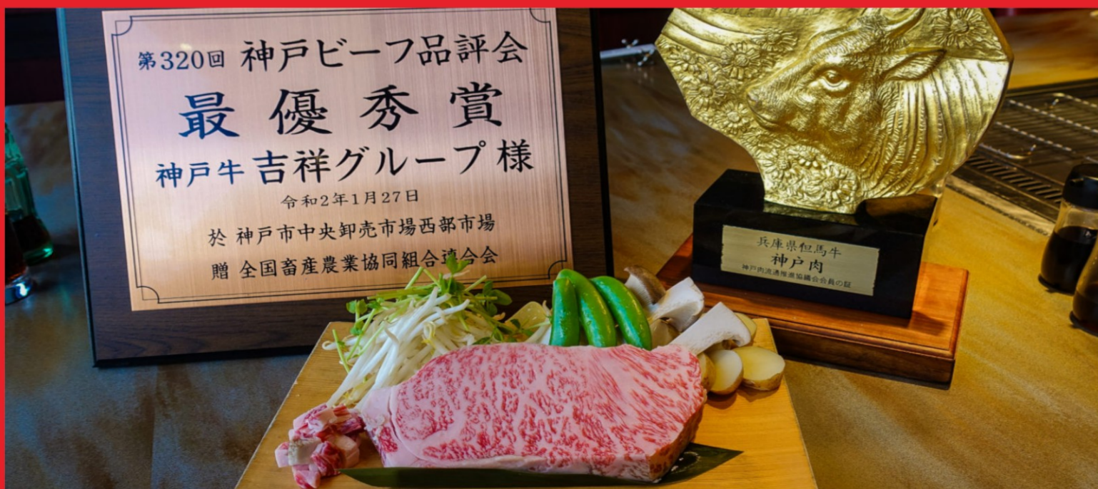
Add wagyu A5 (4oz) (to your meal only) $ 60.00