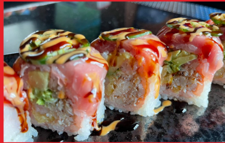
Spring Roll $ 19.95 Real blue crab, avocado & shrimp tempura, wrapped in soy paper, topped with bluefin, jalapeno, creamy wasabi sauce and unagi sauce