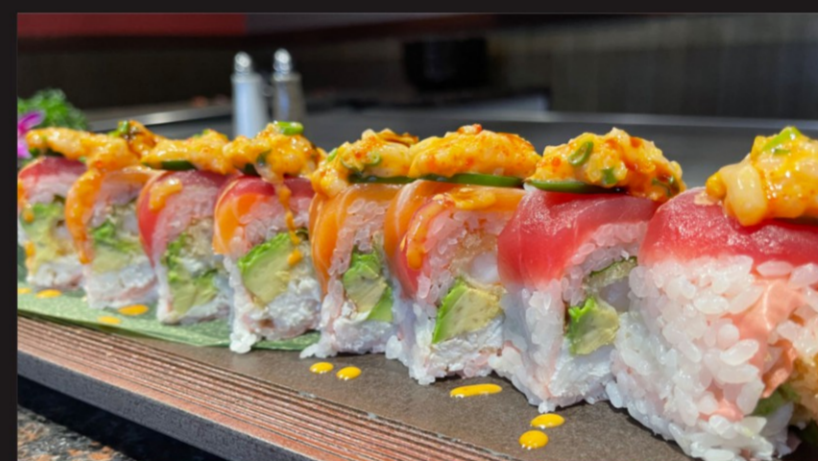
New Tokyo Roll

snow crab shrimp tempura oba leaf avocado wrapped in soybean paper top tuna salmon & spicy scallop jalapeno