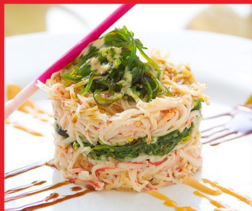
Kani salad $ 10.95 spicy kani, seaweed & chef's special sauce