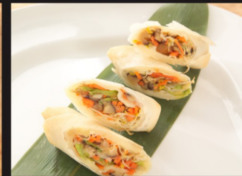
Spring Roll $ 6.00 Deep fried vegetable roll