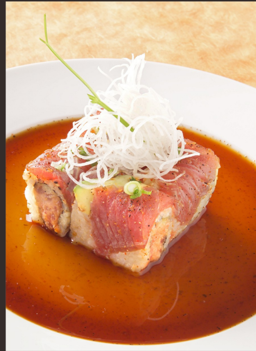
Kobe Roll With tuna $ 20.00 Spicy tuna Cucumber inside Topped with Peper Tuna and Avocado Spicy Ponzu Scuce