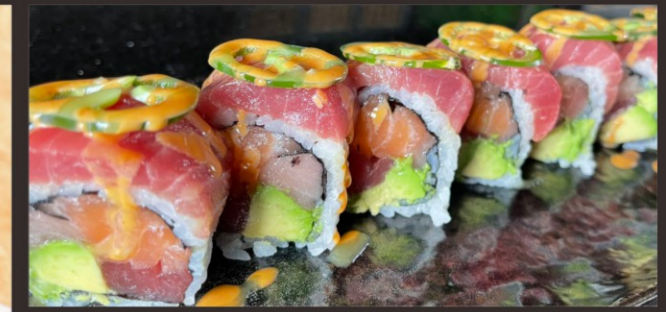
Luca Roll $ 23.95 Bluefin tuna, salmon, yellowtail, avocados, Unagi sauce wrapped in soy wrap, topped with hon maguro, shiso leaf, yuzu sauce, jalapeno