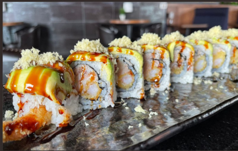
Lucky 7 Roll $ 17.95 Shrimp tempura, cream cheese, blue crab, topped with avocado, tempura flakes and Unagi sauce