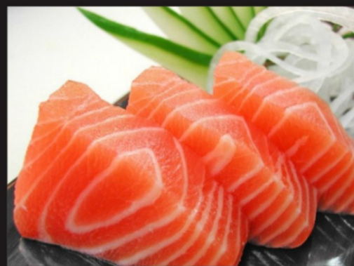
Fresh Salmon (Sake) Sushi 1pc $ 3.00 Sashimi 3pc $ 9.00