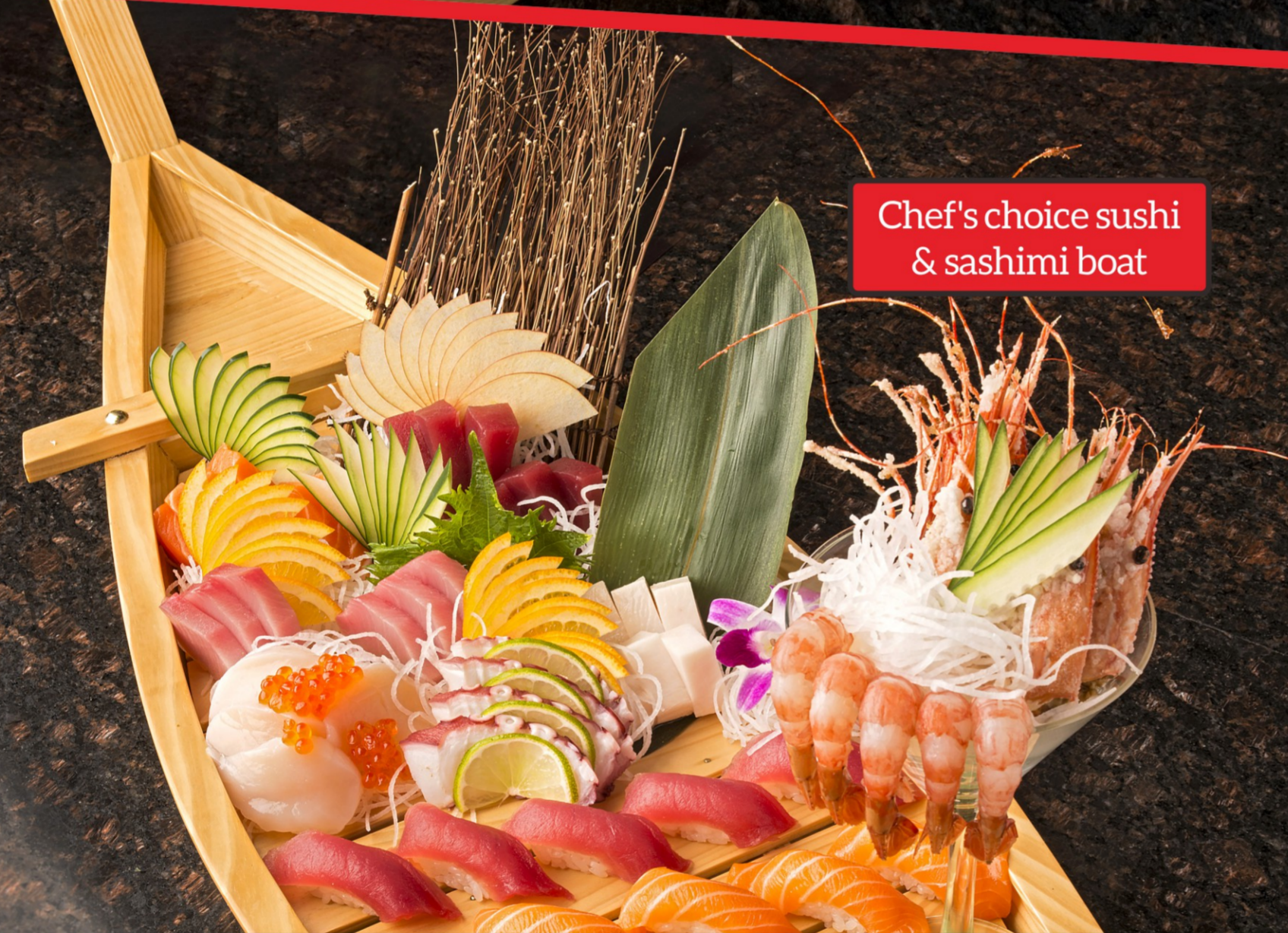
Chef's choice sushi & sashimi boat