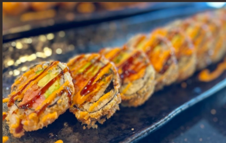
BMW Roll $ 17.95 Spicy tuna, avocado deep fried and top 3 sauce