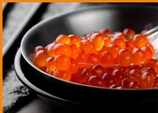
Salmon Roe (Ikura) Sushi 1pc $ 4.00 Sashimi 1pc $ 4.00