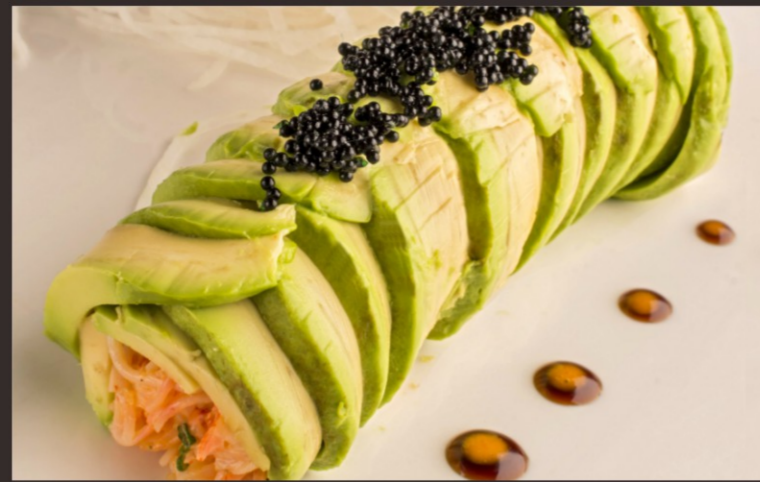
Downtown Roll $ 18.00 spicy crab wrapped by avocado with black caviar on the top