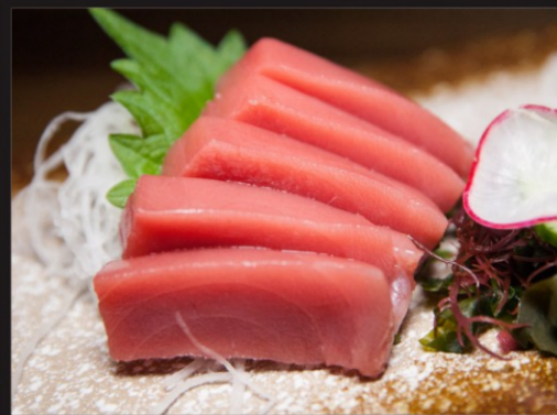
Blue fin tuna Sushi 1pc $ 3.50 Sashimi 3pc $ 10.50