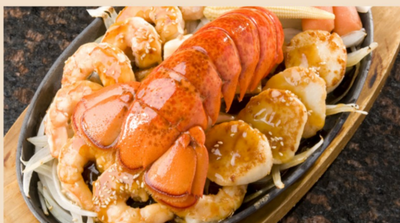
Seafood Teriyaki $ 32.95