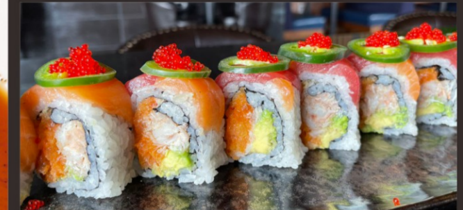
Minnesota Roll $ 19.95 Spicy salmon, blue crab, avocado topped with salmon, tuna and thin slice of jalapeno and tobiko