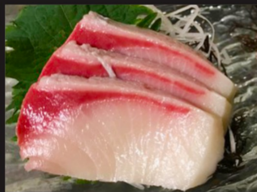
Yellowtail (Hamachi) Sushi 1pc $ 3.00 Sashimi 3pc $ 9.00