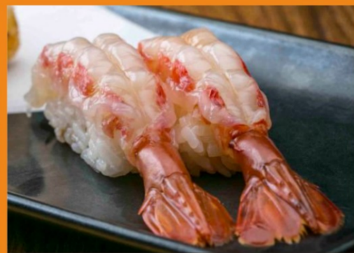
Sweet Shrimp 1pc sushi or sashimi $ 6.50