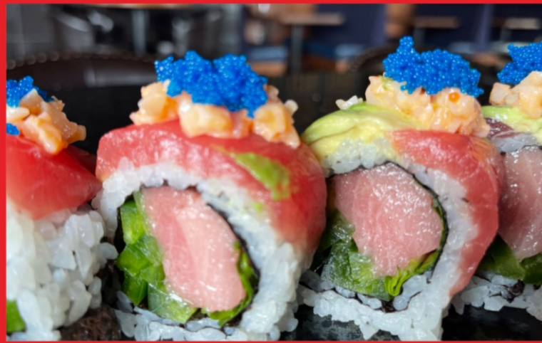
Lake's Roll $ 28.00 Negi toro, cilantro, jalapeno, topped with bluefin tuna, avocado, spicy scallops, blue Masago