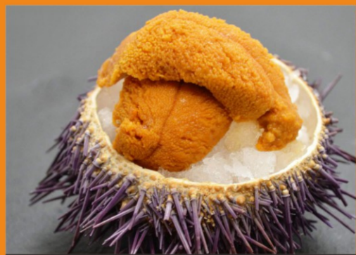
SEA URCHIN (UNI) SEASONAL PRICE