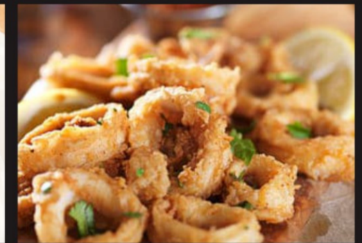
Must Try Calamari $ 11.95 Deep fried calamari w/house hot sauce