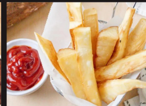
Yucca fried $ 10.95