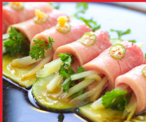
Yellowtail Jalapeno $ 15.95 5pcs yellowtail w/jalapeno in chef's special yuzu sauce