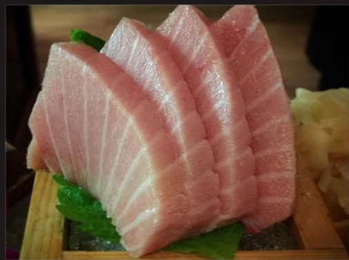
Fatty Tuna (Toro) Per pc $ 5.50