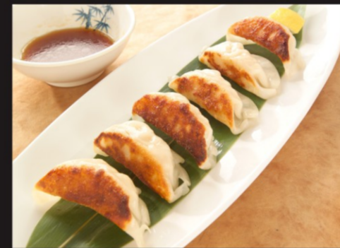
Gyoza (6pcs) $ 7.95 Choose from beef . Pork . Shrimp or vege

WAGYU STEAK (A5) HOT ROCK $ 20.00 ( 2 PCS ) $ 38.00 ( 4 PCS )