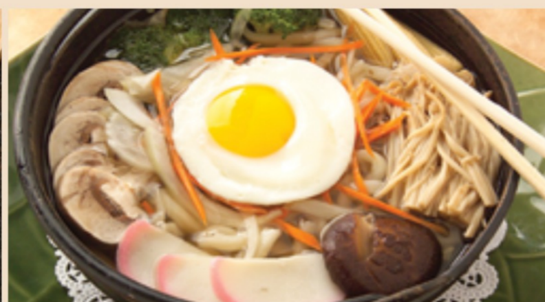
Nabeyaki Udon $ 19.95 Noodle soup with chicken, vegetable, egg and shrimp tempura