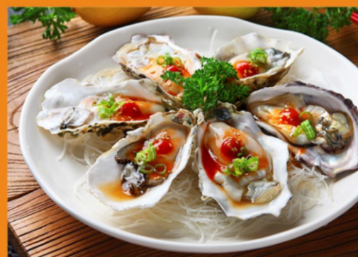
Oyster sashimi only (1pc) $ 3.50