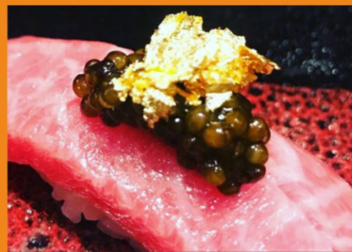
Wagyu A5 $ 15.00