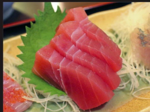
Yellow Fin Tuna Sushi 1pc $ 3.00 Sashimi 3pc $ 9.00