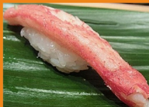
Snow Crab $ 5.00