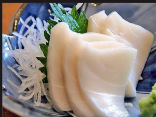
White tuna (escolar) Sushi 1pc $ 3.00 Sashimi 3pc $ 9.00