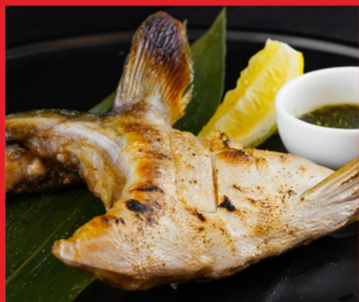
Hamachi karma $ 13.95