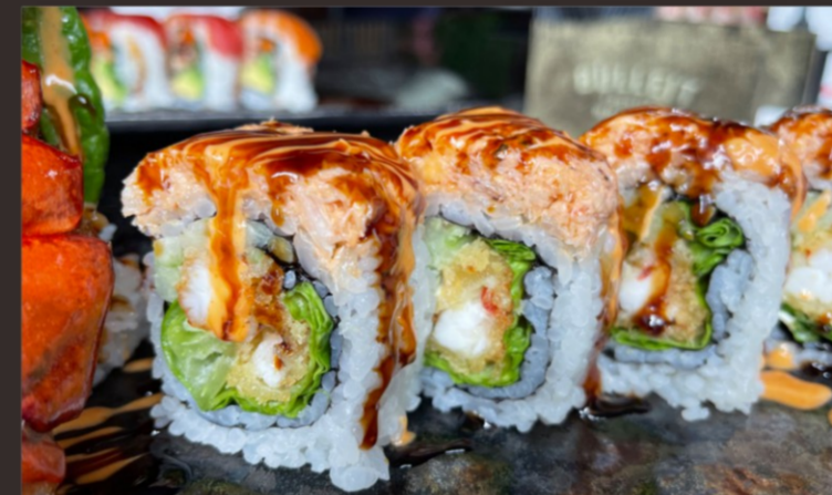
Lobster and Crab Roll $ 30.00 Lobster tempura, lettuce, cucumber, and mayonnaise, top with spicy blue crab and spicy mayonnaise sauce