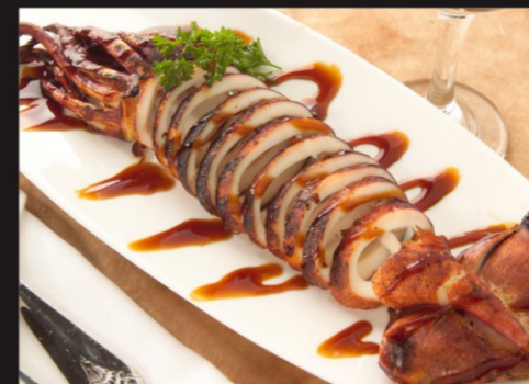
Ika Shogayaki $ 14.00 BBQ fresh squid with ginger sauce