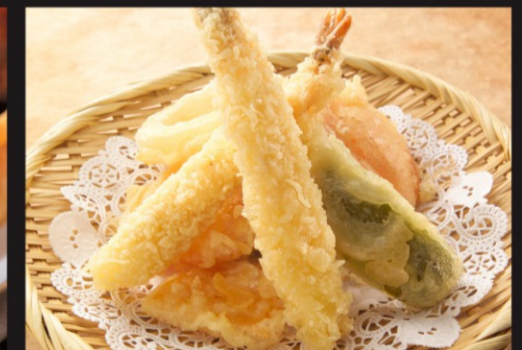
Tempura $ 10.95 Choose from shrimp or VEG