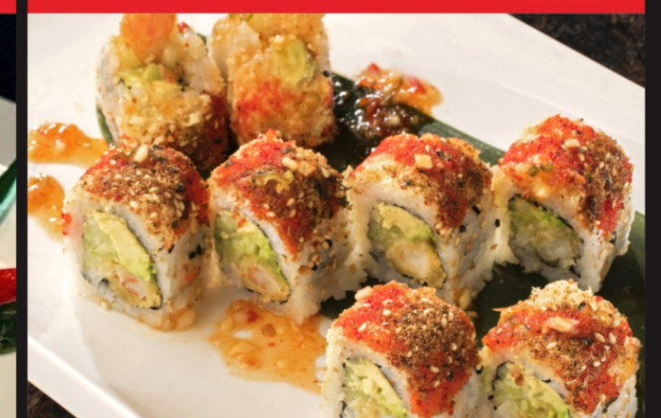
Crunch Roll (8pc)

Shrimp Tempura in Side Topped Crunch Flake and Fish Egg