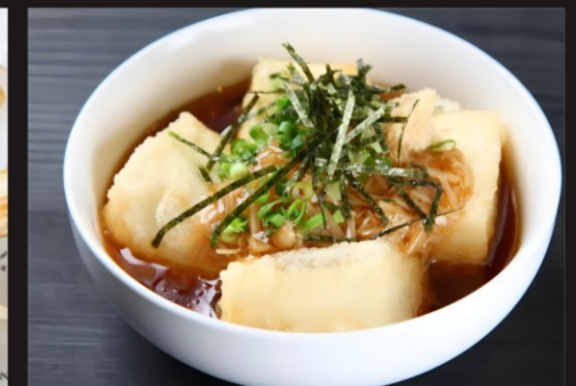
Agedashi Tofu $ 9.00

Please note that a 16 percent service charge is added to all dine-in orders and Pursuant to Minn. Stat. 177.23,subd. 9, this service charge is not a gratuity or the property of any employee. Your server will receive a portion of the service charge.