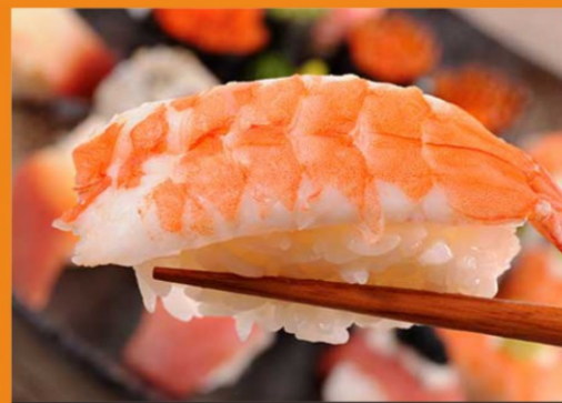
Shrimp (Ebi) 1pc sushi or sashimi $ 2.50