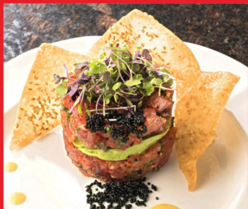
Tuna tar tar $ 13.95