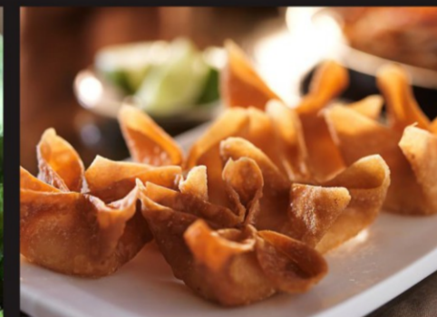
Crab Puff (5pcs) $ 6.95