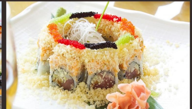
Treasure Island $ 20.00 Yellowtail, tuna, kampyo, inside, spicy blue crab, crunch 4 color tobiko on top