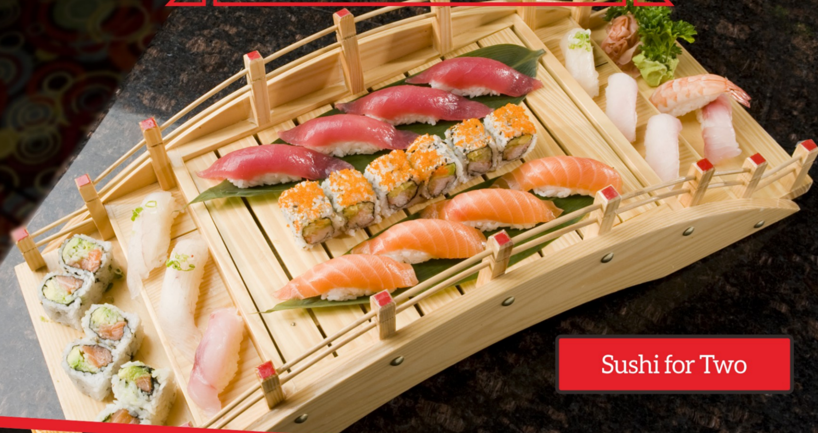
Sushi for Two