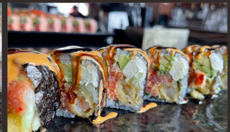
Machu Picchu Roll $ 17.95 Cream cheese, spicy tuna, shrimp tempura, cucumber, cilantro and avocado fried finished with Unagi sauce