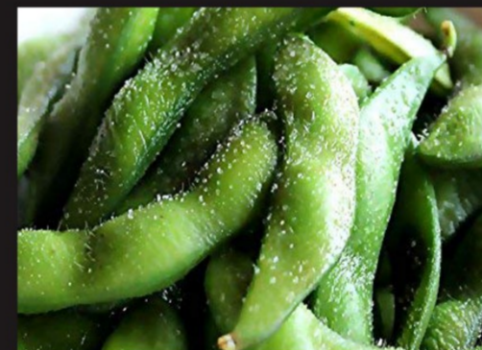
Edamame $ 6.95 Boiled soy beans in sea salt