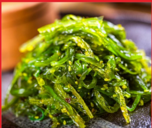
Seaweed salad $ 6.95