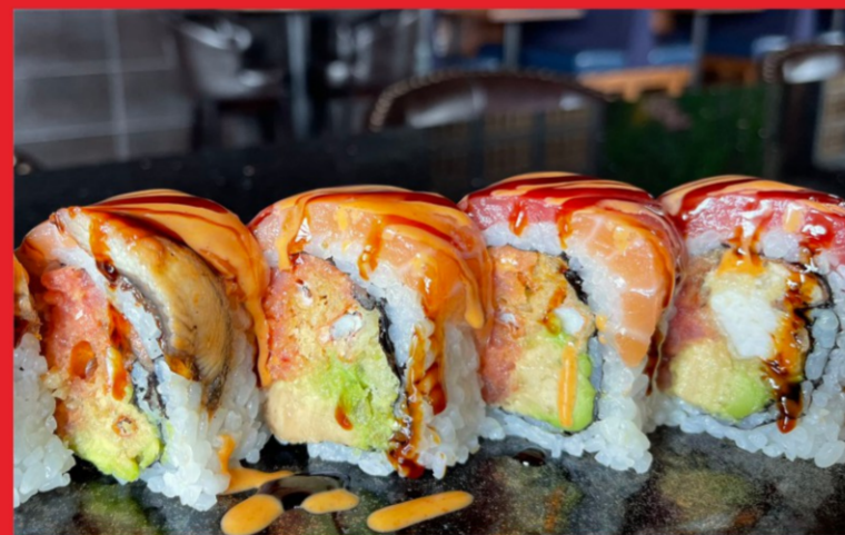
Summer Roll $ 25.00 Soft shell crab, spicy tuna, yamagobo topped with eel and salmon, with touch of chili oil and Unagi sauce