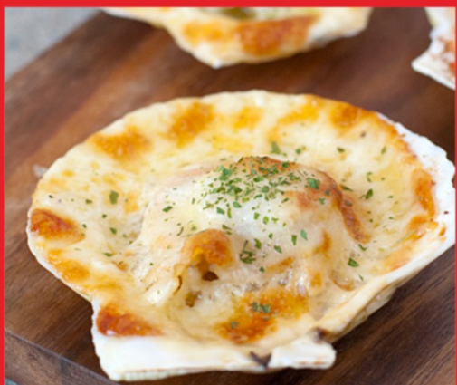
Baked scallops $ 5.95 pc