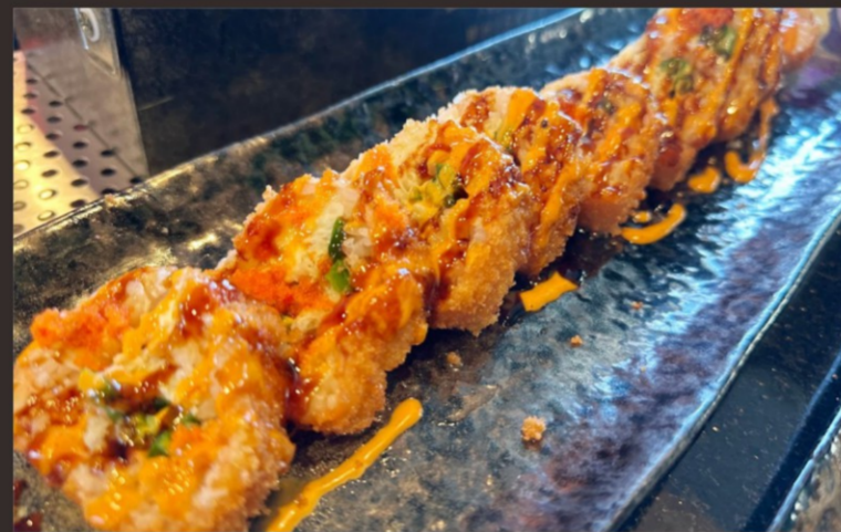
Tiger's Eye Roll $ 17.95 Smoke salmon, blue crab, cheese, cucumber with soy paper deep fried Chef special sauce