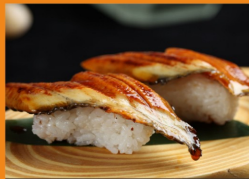
Eel Sushi 1pc sushi or sashimi $ 3.00