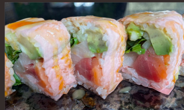
Ginza Roll $ 18.95 Salmon, tuna, yellowtail with cilantro, avocado, jalapeno and cucumber wrapped with soy paper, splash of ponzu sauce, wasabi aioli and chili oil