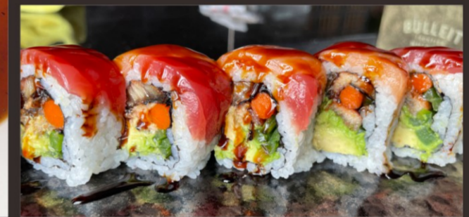
Fall Roll $ 21.00 Tuna salmon and eel .crunch jalapenos topped with eel sauce